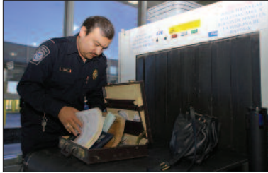
Customs and Border Protection Officers should be focused on the mission of the Department of Homeland Security and not on new personnel regulations.

The FY 2008 DHS Authorization bill (H.R. 1684) authored by Homeland Security Committee Chairman Bennie Thompson (D-Miss.), included language to repeal Title 5, Chapter 97, which allowed the creation of a unique DHS human resources management system. H.R. 1684 was passed by the full House in May 2007. There was no action by the Senate before Congress recessed for the election.