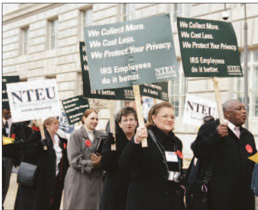
NTEU members from across the country have actively worked to defeat the ill-advised contracts with private collection agencies that are collecting individual tax debts on a commission basis.

On March 9, 2006, the Internal Revenue Service (IRS) awarded one-year contracts to three private collection agencies (PCAs) for the collection of individual tax debts on a commission basis. The IRS renewed the contracts for two of the PCAs for an additional year in February 2007, but decided to terminate the contract with the third. On March 3, 2008, the IRS again renewed the contracts of the two remaining PCAs for one year until March 2009, at which time the IRS can extend them for an additional year or allow them to expire.