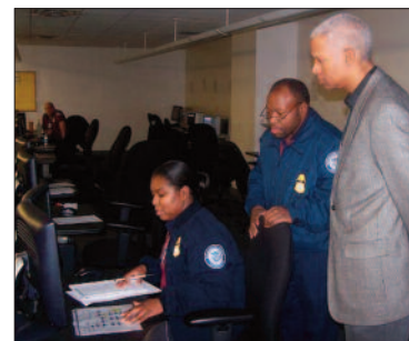
TSOs at Atlanta's Hartsfield-Jackson International Airport with Rep. Hank Johnson (D-Ga.) Johnson has long supported collective bargaining rights for these employees.

NTEU also urges legislative action to ensure permanent rights for TSA employees. ( See page 15 for NTEU's legislative recommendations on TSA. )